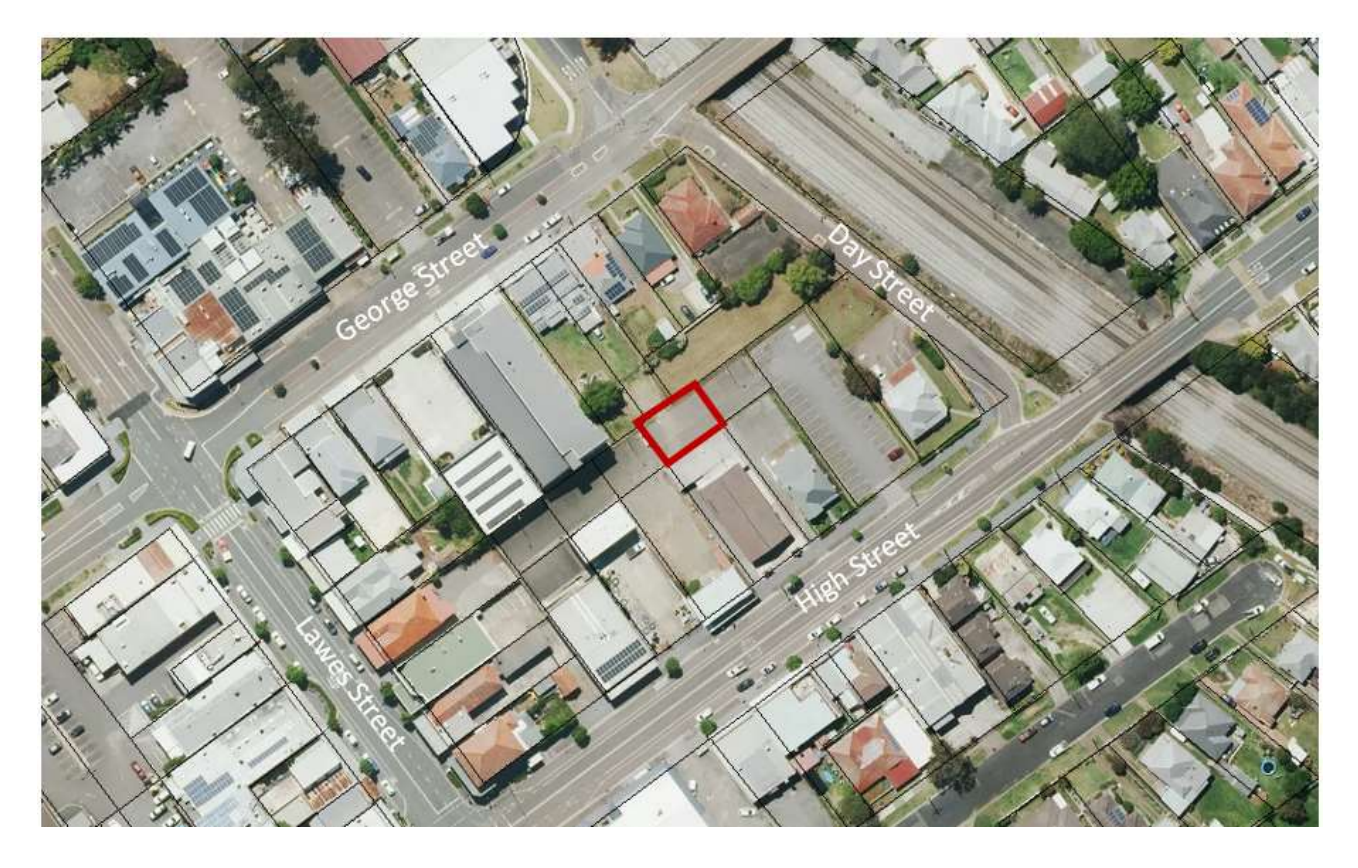
Figure 1: Subject Site, East Maitland

The purpose of the reclassification via an LEP Amendment is to correct an anomaly that exists with a small parcel of land that forms part of Council owned car park adjoining and to rear of commercial properties that are fronting both High and George St, East Maitland. The subject parcel is 215 sqm and is zoned B2 Local Centre under MLEP 2011 .